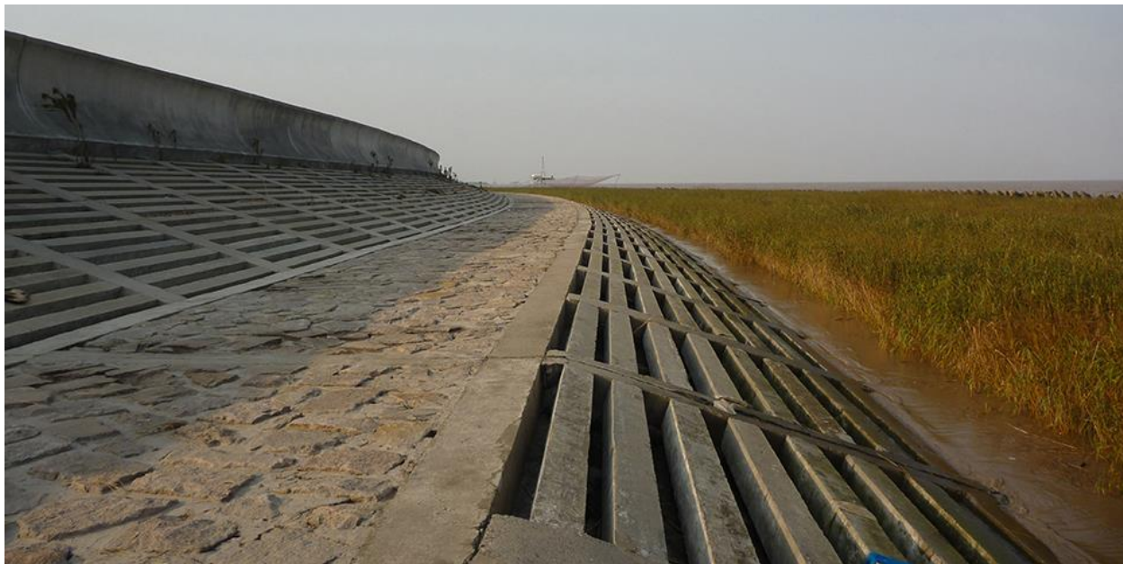
Photo of the Seawall at the East China Sea in Pudong, Shanghai

Shanghai is just west of the East China Sea and North of Hangzhou Bay, making it close to the coast and vulnerable to typhoons, and the history of sea walls in the area dates back to ancient China. Most recently, a 1997 Shanghai municipal government policy, “the Shanghai Coastal Levees Regulation,” called for heightening and reinforcing the seawalls. In addition, the municipal government also mandated beach nourishment projects in addition to reinforcement of the seawalls. Finished in 2002, the current seawalls are designed for level 12 typhoons (center wind speed >32.7m/s) with a 100 year return period. The current seawalls are 523 km (325 miles) long and protect the area of 2600 km 2 and 2.5 million people against the typhoons. 11 The walls were built along the south bank of the Yangtze River (106.8 km, 21 percent of the total length), the north bank of the Hangzhou Bay (95.5 km, 18.7 percent of the total) and around the Chongming Islands of Shanghai (307.7 km, 60.3 percent of the total). 12 The seawall project is called a “Great Green Wall,” because it has been covered with trees, grass and playgrounds for public use and enjoyment.