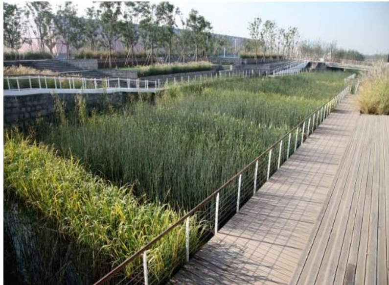
Photo of Houtan Park on the Huangpu Waterfront: A Constructed Wetland for Ecological Flood Control.

Like many other cities in developed countries, Shanghai has also started to implement ecological flood control methods to harmonize the overall climate and to preserve the environment utilizing natural resources. Shanghai is increasing its natural resilience by using the absorption capacity of soil and plants to improve drainage. The city is also constructing green roofs to reduce rain runoff and heat island effects, and maintaining wetlands in the city. In the long run, it is a very effective way to decrease the impact of extreme weather events.